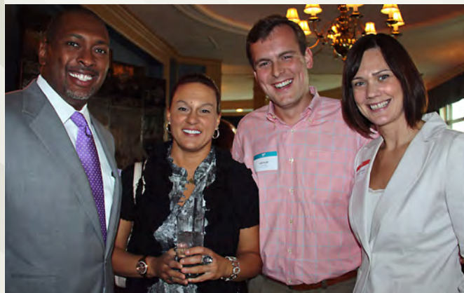
Next Generation UPAF Members enjoy the 2011-12 Member Welcome Event at the University Club.